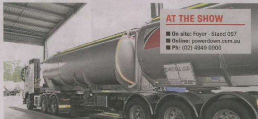
EXCITING DEVELOPMENTS: The Powerdown team will be available to discuss new developments at the show.

Key performance features of this new fluid include a superior ability to distribute heat, which facilitates high rates of heat dissipation within the fluid and a superior flash point compared to traditional